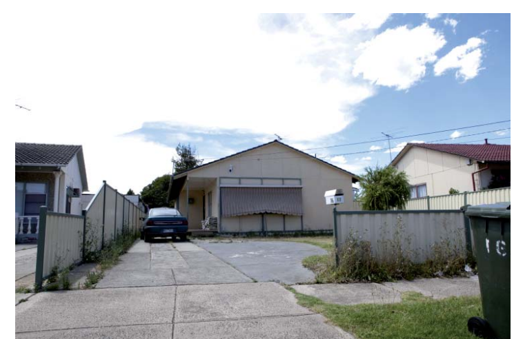
concrete finish houses